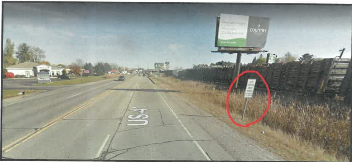
Northbound USH 41: "Compression Brake Prohibited" sign

The only existing sign informing truck drivers of this prohibition is located on northbound USH 41, between Roosevelt Road and Cleveland Avenue. There are no signs at any other entry point into the city.